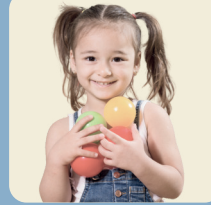
Rhythm & Rhyme