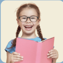
Words & Wiggles