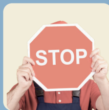
Language & Logos