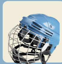
Sports & Scarves