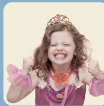
Pretend & Perform